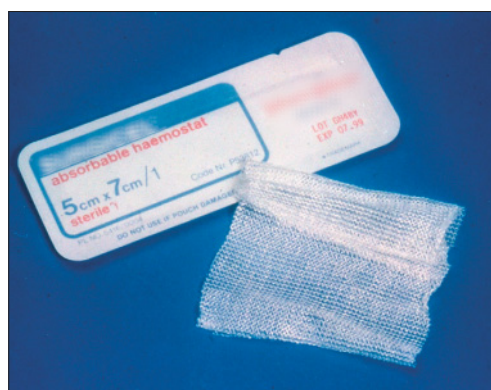
Fig. 2 Resorbable haemostatic agents can be placed in sockets to aid healing