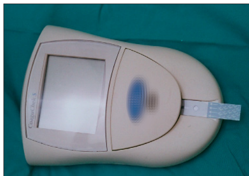
Fig. 5 The INR can be measured at the chair side by portable machines that require only a finger-prick blood sample

Patients taking warfarin should have their INR (International Normalised Ratio – a measure of the prothrombin time) measured prior to any surgical procedure. This can now be performed at the chair-side with a finger-prick sample (Fig. 5). The normal therapeutic INR for patients on warfarin is 2.0 to 3.0 except for those with cardiac valve replacement where the range is 2.5-3.5. A level above 4.0 is non-therapeutic and requires adjustment of the warfarin dose. There does not appear to be a universally acknowledged satisfactory INR for dental surgery. One question that has to be addressed is whether it is more dangerous to reduce the level of anticoagulation with the risk of a thrombo-embolic episode than to perform surgery in the warfarinised patient. There is evidence that patients are more likely to die from a thrombo-embolic problem than they are to develop a bleed that does not settle with local haemostatic measures. 4