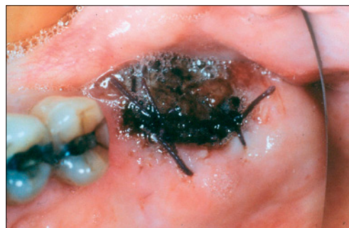
Fig. 3 A haemostatic pack held in place with sutures

of a haemostatic pack can control this (Figs 2 and 3). Replacement therapy is required if the platelet level is less than 50 \times 10^9/L . Normally a platelet transfusion will be performed 30 minutes before surgery. If the problem is one of idiopathic thrombocytopenia oral systemic steroids can be prescribed for 7 to 10 days pre-operatively. This can increase the platelet numbers to a suitable level.