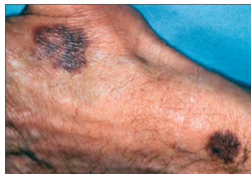
Fig. 4 Bruising on the hand should alert the dentist to a bleeding problem

Normally local haemostatic measures are sufficient to control post-extraction bleeding in patients taking antiplatelet medication